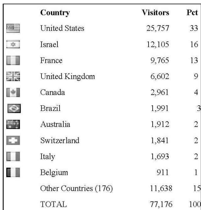
Table 3. Number of visitors by country